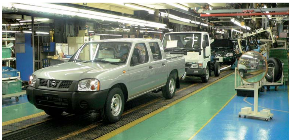
Production line for small commercial trucks

In the future, Nissan Diesel plans to build a WIN-WIN relationship by improving its corporate capabilities and expanding various possibilities that will enable it to create benefits for Nissan Diesel and Nissan Motor, while simultaneously developing and producing high-quality small commercial vehicles and diesel engines, and supplying high-quality, attractive products to its customers through Nissan Motor.